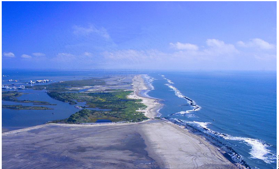
East Timbalier Island Unit S05.

This documentation can be used to either obtain flood insurance through the NFIP for eligible structures or to otherwise document a location's status within or outside of the CBRS for other purposes (e.g., real estate transactions