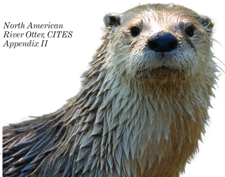
North American River Otter; CITES Appendix II

Live animal and plant shipments. All shipments of live animals and plants must be prepared to minimize risk of injury, damage to health, or cruel treatment.