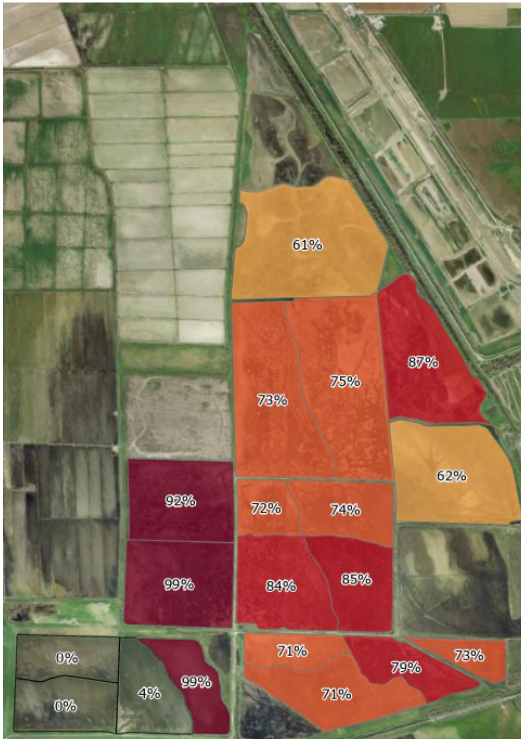
Figure 7. Proportional increase in >blind height flood duration over baseline conditions attributable to the Big Notch under maximum impact years. Maximum impact water years defined as the four years which had the largest cumulative difference in duration between baseline and big notch scenarios. Values are presented by wetland unit in the North Area. Shading corresponds to values.