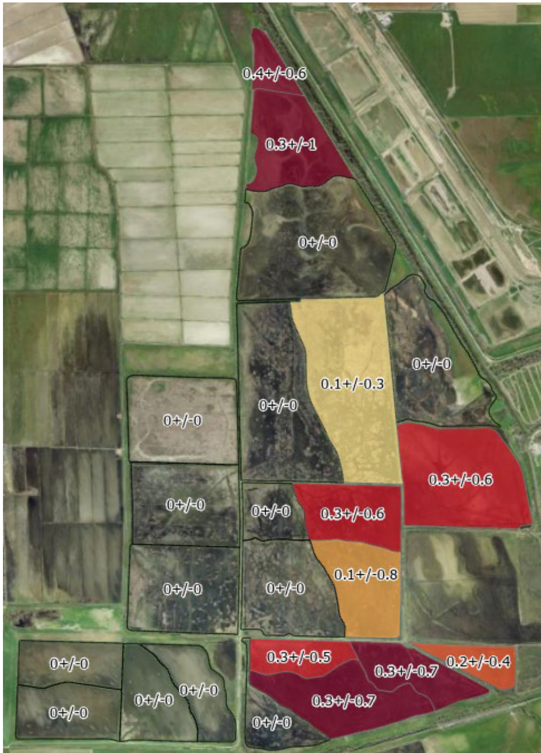
Figure 10. Averaged annual difference of >berm height flood event count between baseline and Big Notch scenarios, for wetland units in the North Area. Unit specific values are presented, followed by standard deviation values. Shading corresponds to values.