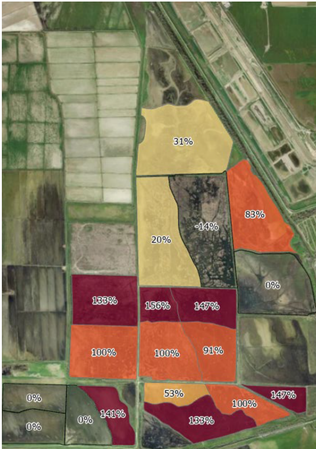
Figure 8. Proportional increase in >blind height flood event count over baseline conditions attributable to the Big Notch Project under maximum impact years. Maximum impact water years defined as the four years which had the largest cumulative difference in flood events between baseline and big notch scenarios. Values are presented for each wetland unit in the North Area. Shading corresponds to values.