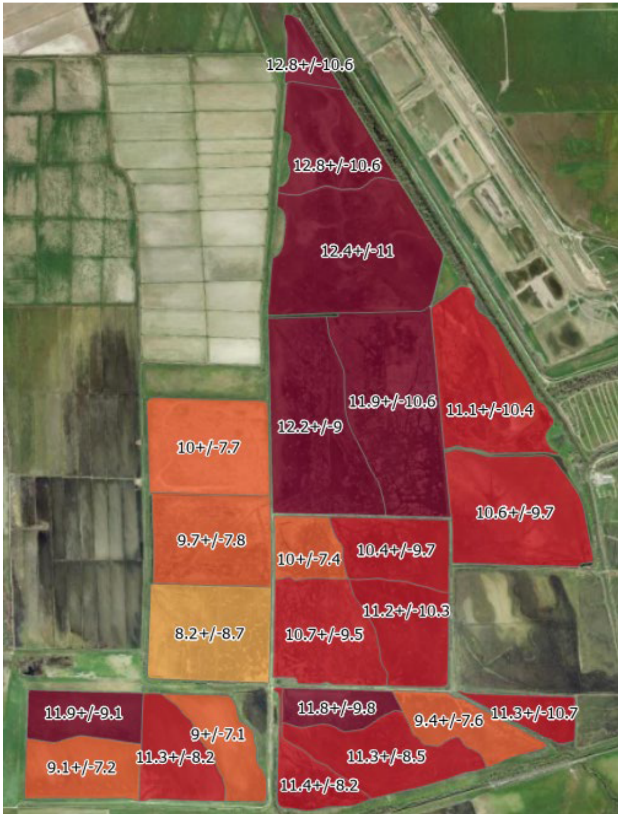
Figure 1. Averaged annual difference of 6+ inch flood duration between baseline and Big Notch scenarios, for wetland units in the North Area. Unit specific days are presented, followed by standard deviation values. Shading corresponds to values.