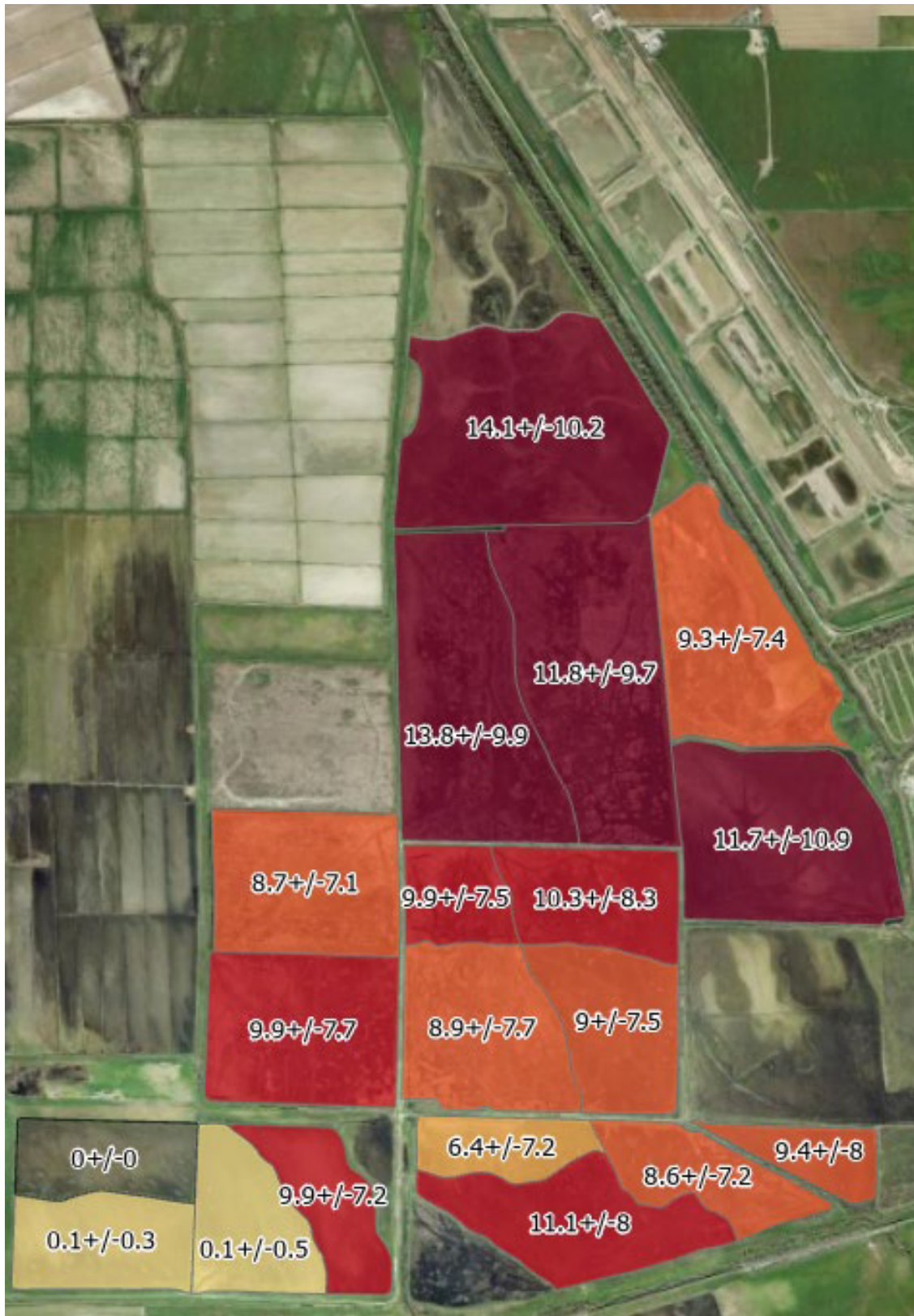
Figure 5. Averaged annual difference of >blind height flood duration between baseline and Big Notch scenarios, for wetland units in the North Area. Unit specific days are presented, followed by standard deviation values. Shading corresponds to values.