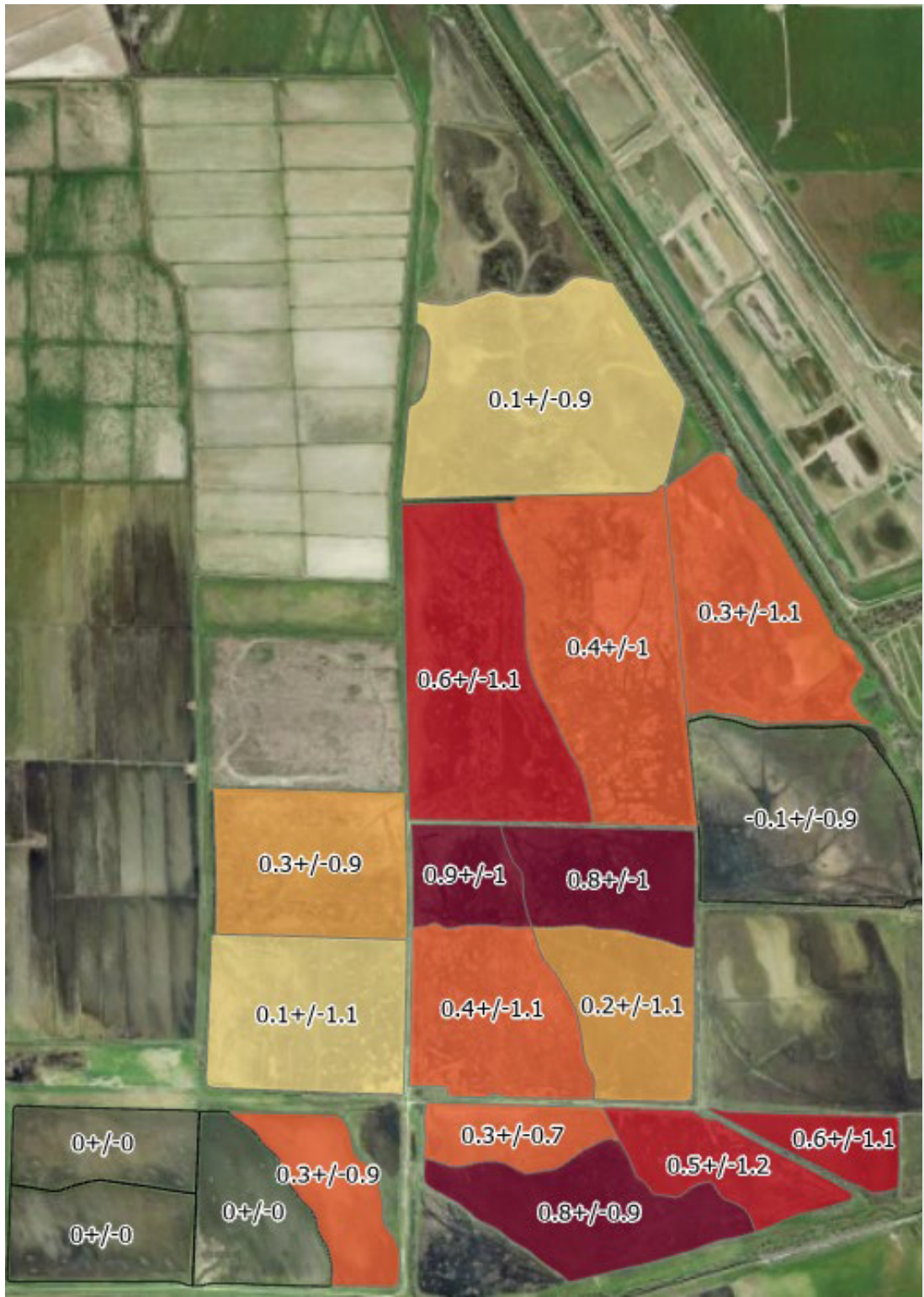
Figure 6. Averaged annual difference of >blind height flood event count between baseline and Big Notch scenarios, for wetland units in the North Area. Unit specific values are presented, followed by standard deviation values. Shading corresponds to values.