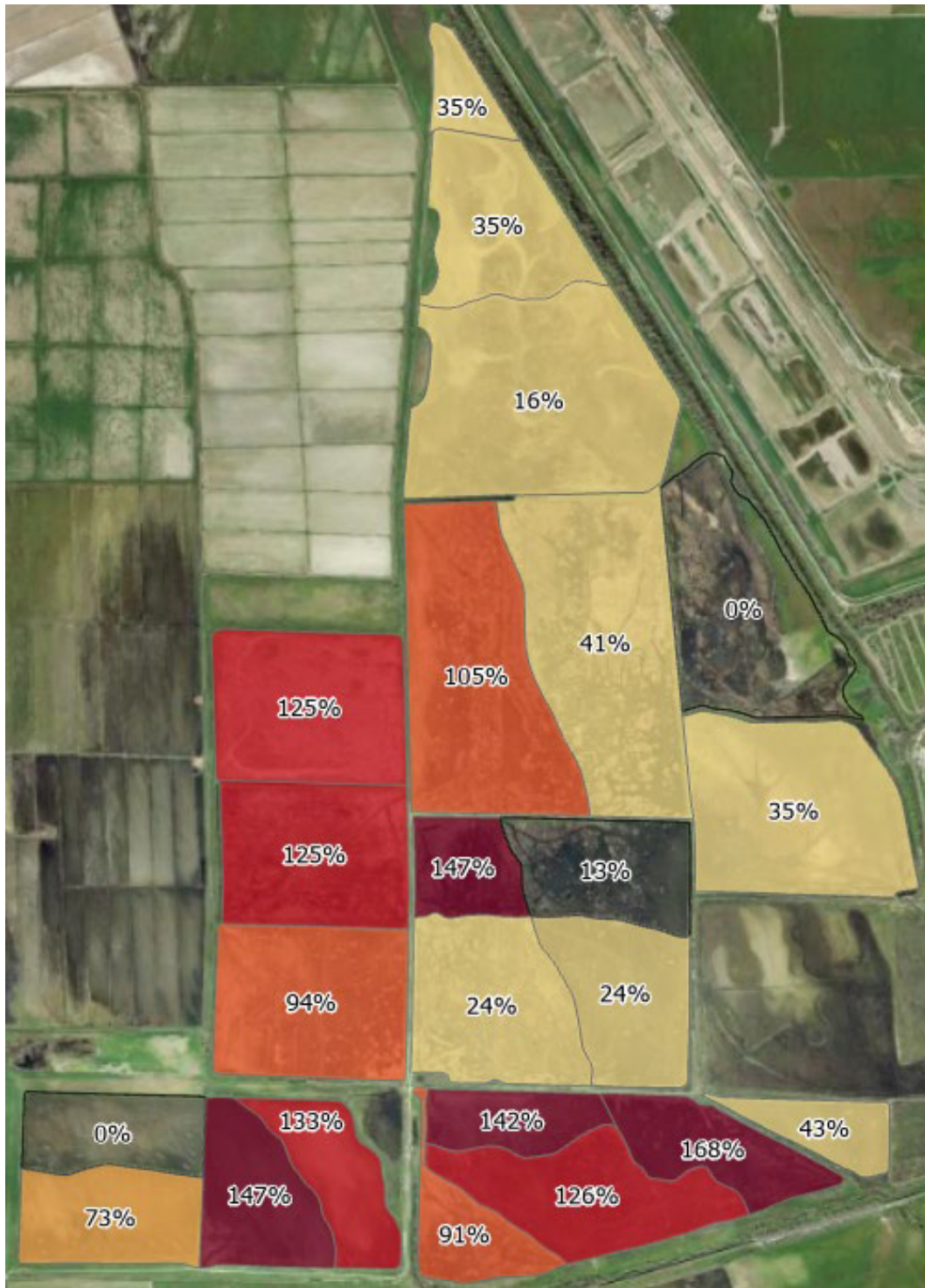
Figure 4. Proportional increase in +6-inch flood event count over baseline conditions attributable to the Big Notch Project under maximum impact years. Maximum impact water years defined as the four years which had the largest cumulative difference in flood events between baseline and Big Notch scenarios. Values are presented by wetland unit in the North Area. Shading corresponds to values.