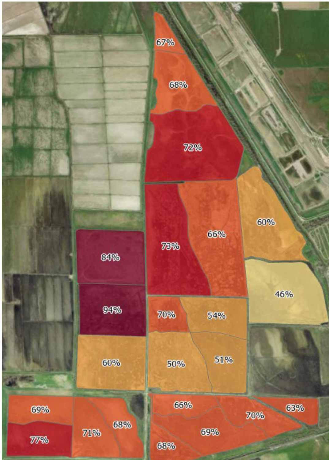
Figure 3. Proportional increase in +6-inch flood duration over baseline conditions attributable to the Big Notch Project under maximum impact years. Maximum impact water years defined as the four years which had the largest cumulative difference in duration between baseline and Big Notch scenarios. Values are presented for each wetland unit in the North Area. Shading corresponds to values.