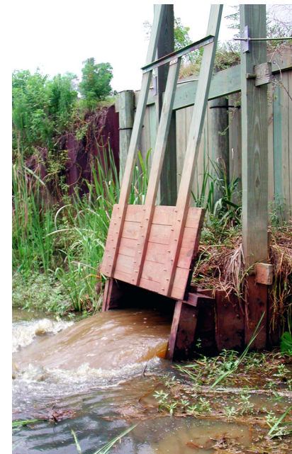
Rice field trunk

Rice field trunks were first used in the 1700s on all rice plantations along the tidal freshwater rivers from Georgetown, South Carolina to Brunswick, Georgia. Today the refuge still uses handmade, wooden rice field trunks to control the water levels within the impoundments.