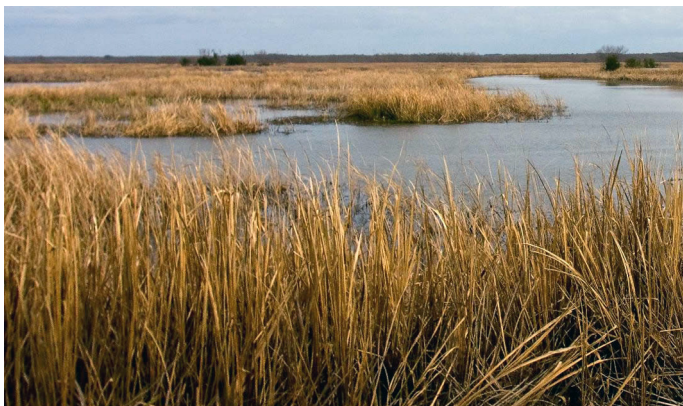
Freshwater marsh, credit: Kirk Rogers

The refuge, unless otherwise posted, is open to hiking, biking, wildlife observation, interpretation, environmental education, and photography.