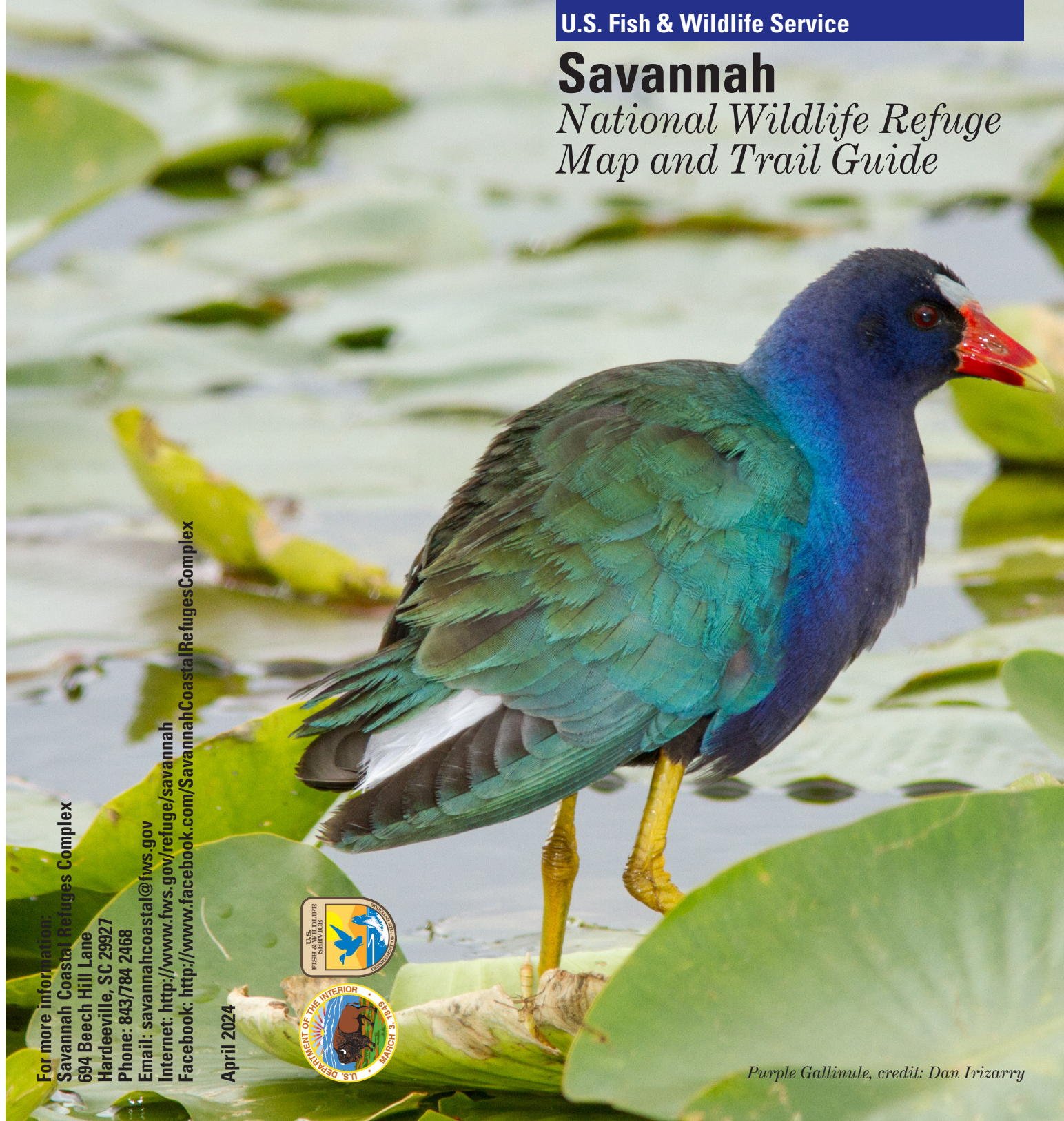
Purple Gallinule