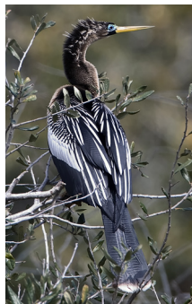
Anhinga by Kirk Rogers