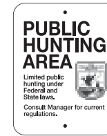
Public Hunting Area

This area is open to public hunting, according to the regulations in this brochure