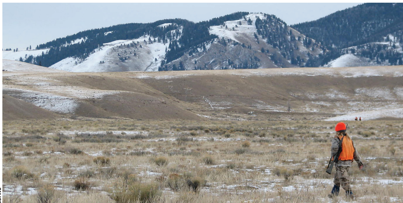
Snow is often encountered during the elk and bison hunts on the Refuge.