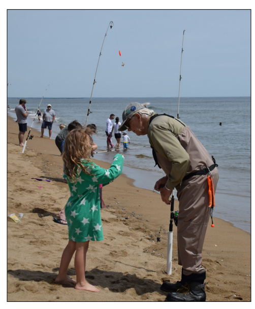
A local angler teaches a young visitor.

Plum Island: Surf casting is allowed year-round from open areas of the refuge beach.