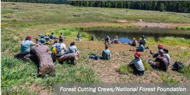
Forest Cutting Crews/National Forest Foundation

The Wood for Life “Playbook”, linked in the resources section, contains a wealth of information that can help partnerships implement similar programs in their geographies.