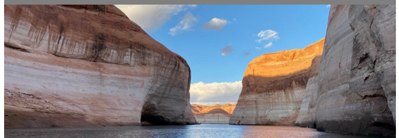
Minerals Deposited as the Water Level Dropped in Lake Powell