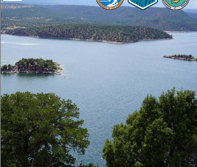
Flaming Gorge Reservoir is a Hub for Recreation