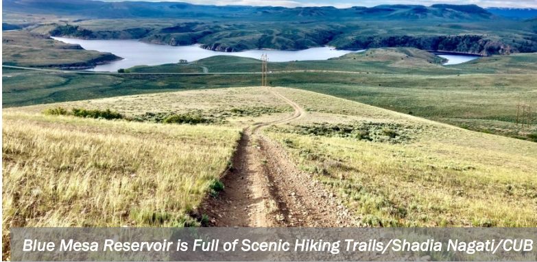
Blue Mesa Reservoir is Full of Scenic Hiking Trails

In many reservoir gateway communities, partners' strong emotional connections to their environment didn't just cause them heartbreak at seeing it change – they now seek community-led initiatives to preserve special places.