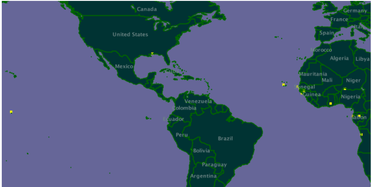
Figure 1 (above). Global distribution of S. melanotheron . Map from GBIF (2010).