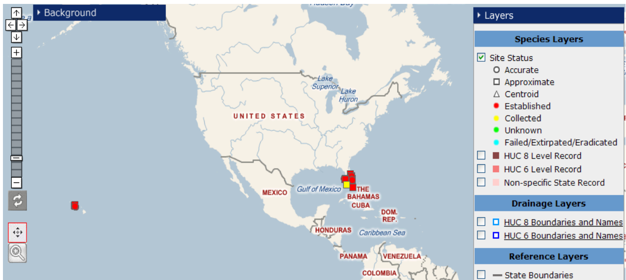
Figure 2 (above). Distribution of S. melanotheron in the United States. Map from Nico and Neilson (2014).