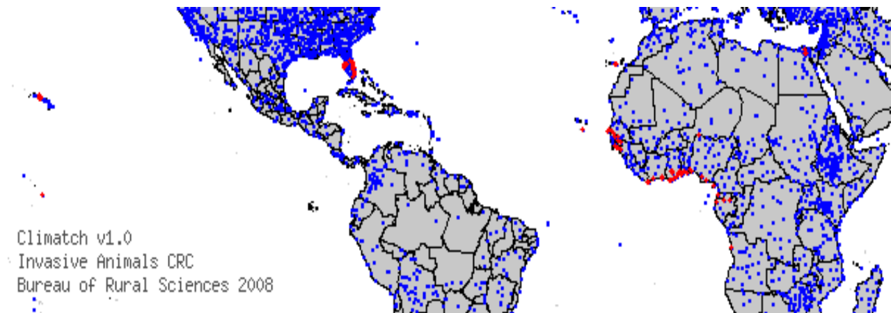
Figure 3 (above). CLIMATCH (Australian Bureau of Rural Sciences 2010) source map showing weather stations selected as source locations (red) and non-source locations (blue) for S. melanotheron climate matching. Source locations from GBIF (2010) and Nico and Neilson (2014). Only established locations were used for climate matching.

The climate match (Australian Bureau of Rural Sciences 2010; 16 climate variables; Euclidean Distance) was high in Florida and southern California. Medium matches ran along the West Coast, southern border, and the southern East Coast. Low and low-medium matches covered the rest of the country. Climate 6 match indicated that the United States has a high climate match. The range for a high climate match is 0.103 and greater; the climate match of S. melanotheron is 0.116.