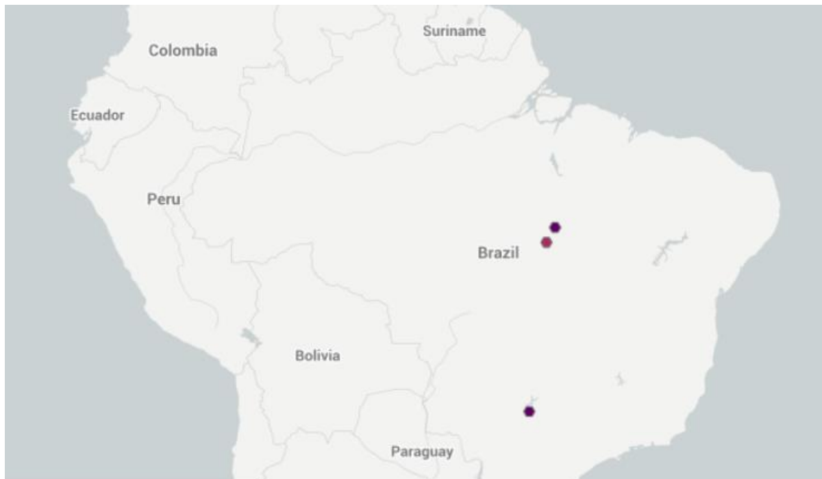
Figure 1. Known global distribution of Serrasalmus geryi , reported from Brazil. Map from GBIF Secretariat (2017). The southernmost reported location is not in the Tocantins River basin, and was not included in the climate matching analysis.