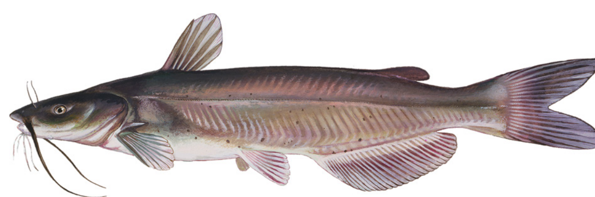
Channel Catfish Ictalurus punctatus