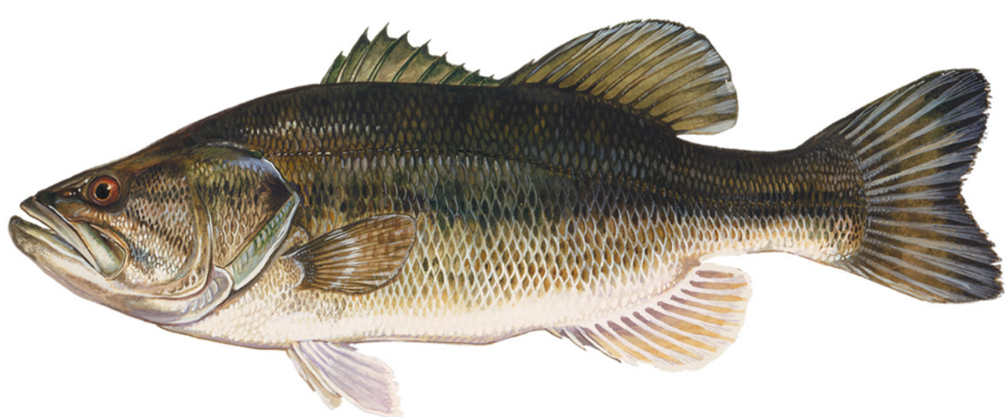
Largemouth Bass Micropterus salmoides