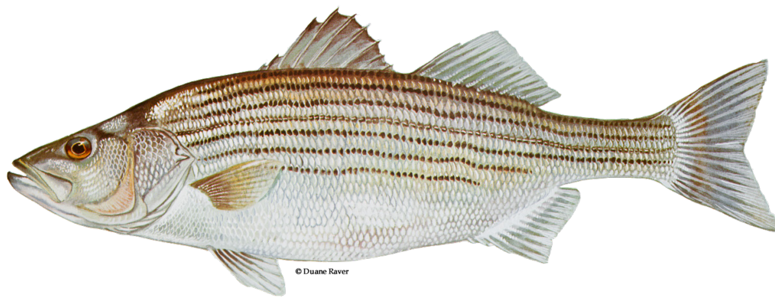
Striped Bass Morone saxatilis