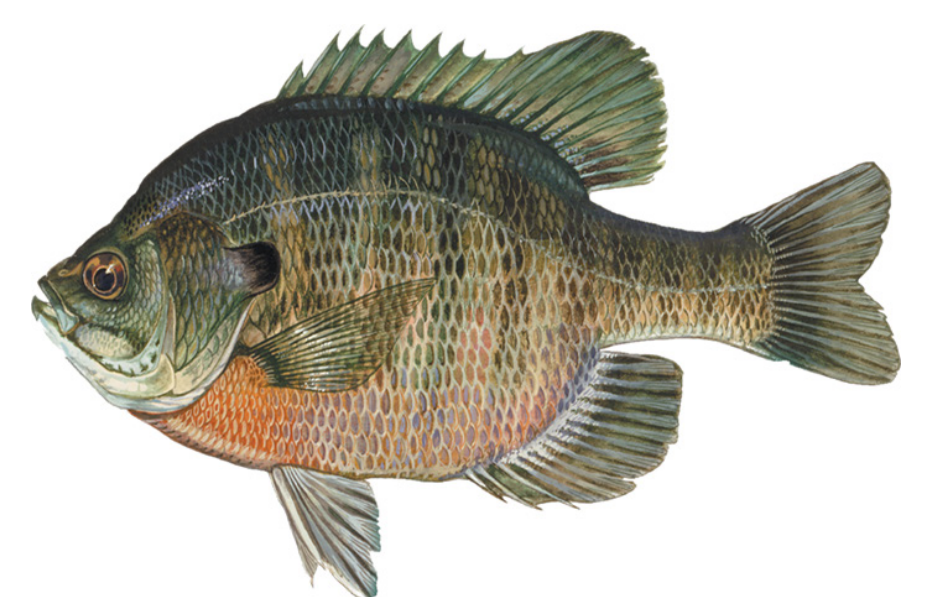
Bluegill Lepomis macrochirus