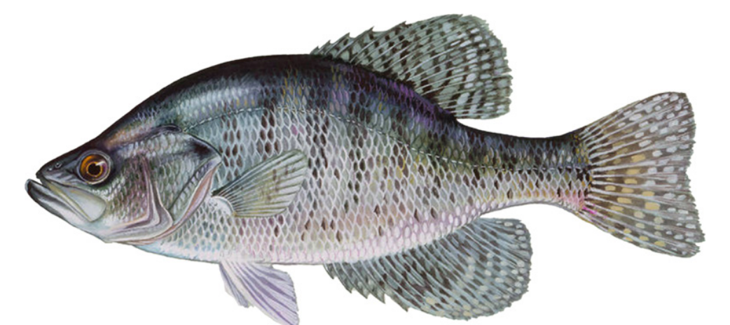
White Crappie Pomoxis annularis

Fish illustrations courtesy of USFWS, Fisherman on Lake Texoma