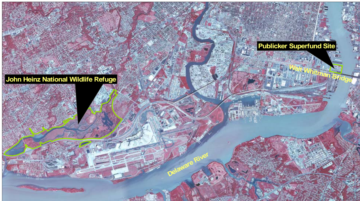
Figure 2. The Publicker Industries Inc. Superfund Site is located seven miles upstream from the John Heinz National Wildlife Refuge.

added to the National Priorities List in May 1989, and a Record of Decision (ROD) for the site stabilization was completed in June 1989. Since then, the site has been cleaned up by the EPA and deleted from the National Priorities List in November 2000. Prior to the cleanup, however,