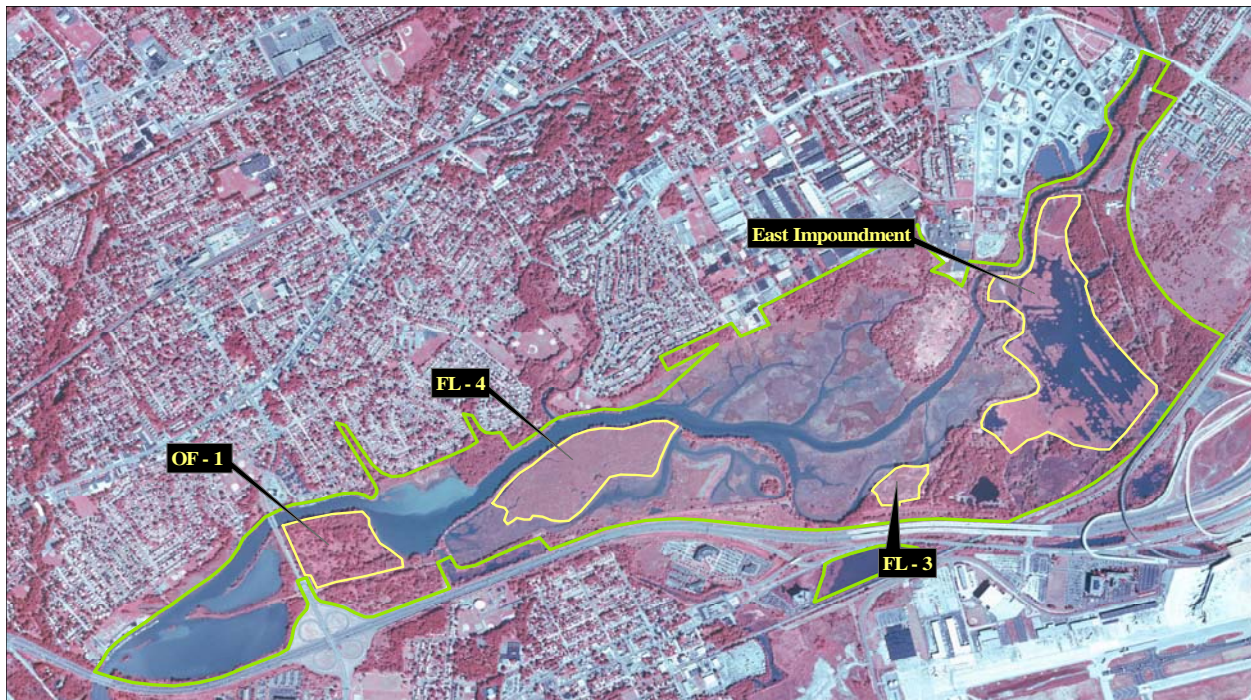
Figure 3. Restoration Alternatives for JHNWR.

The main component of this alternative would involve the removal of existing fill to restore tidal wetland, replicating the depth and slope of the original wetland's creek and mudflat (Woodlot 2002). Fill would be excavated down to the elevation of the adjacent tidal marsh. Daily tidal flows would be provided by excavating a narrow breach in the dike to allow free movement of tidal waters into and out of the restored basin. A concrete water control structure with a screw-gate control would be installed in the breach to allow Refuge personnel to block flows into or out of the basin in the event of a catastrophic oil spill, to control invasive plant species, and to