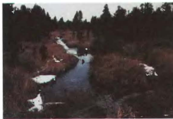
Figure 1. Cedar Run in Cedar Bog Nature Preserve. Cedar Run drains bog meadows and marl meadows of Cedar Bog, a relict alkaline fen.

Large coastal marshes border the southwestern shore and Sandusky Bay of Lake Erie (fig. 2A). These marshes generally range from 1 to 2 miles in width and are interrupted by points of higher land and developed areas. Undisturbed shores of western Lake Erie have marshes fronted by low barrier beaches and interspaced with river mouths. These wetlands are protected by constructed earthen and rock dikes. Two sand spits separate Sandusky Bay from Lake Erie and protect extensive wetlands in the bay. East of Sandusky Bay, low, marshy backshores grade into low bluffs, and wetlands in this area are restricted to mouths of tributaries such as the Huron River and Old Woman Creek. A large wetland, Mentor Marsh, occupies the former valley and delta of the Grand River. Twelve bedrock islands in western Lake Erie have rocky shores, but small embayments on large islands contain wetlands (Herdendorf, 1992).